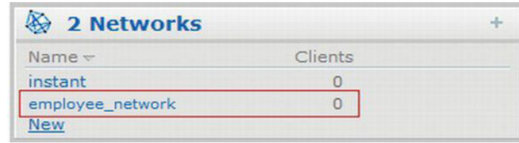
Figure 1 Network Window